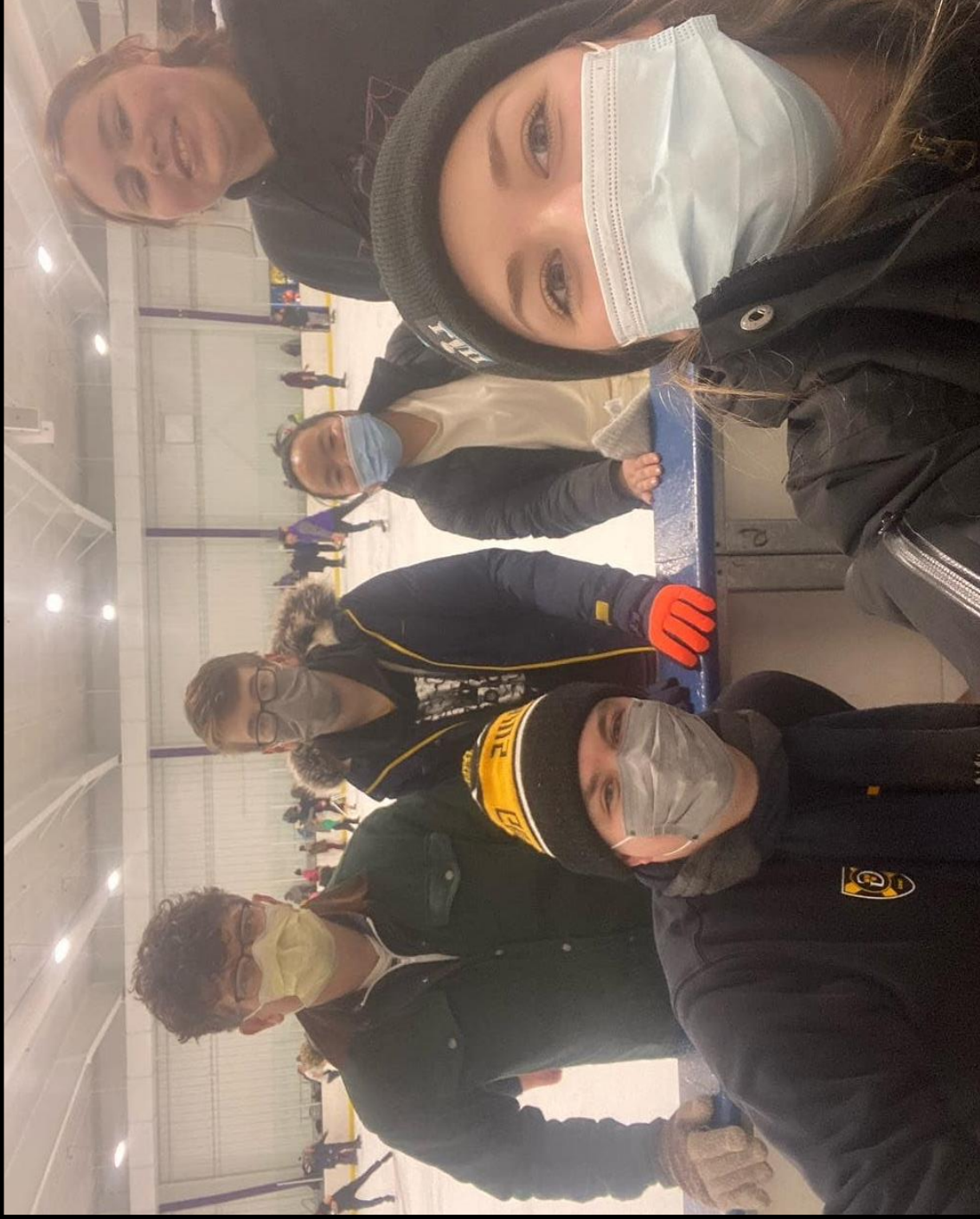
Invite a friend to FLC's youth activities!